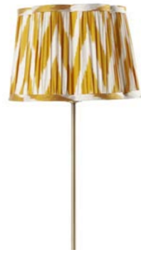
Lampshade Scallop Ikat Yellow 100% Silk on metal frame CA3385 – 30cm/25cm H20cm