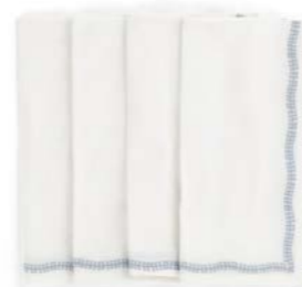
Napkins (set of 4) Embroidery Dusty Blue 100% Cotton