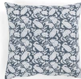
Cushion Cover Jodhpur True Navy 100% Cotton