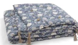
Quilt w. tassels Tangier Pomegranate Blue 100% Cotton w. polyester filling