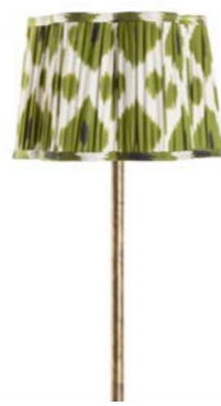
Lampshade Scallop Ikat Green 100% Silk on metal frame CA3382 – 25cm/20cm H17cm