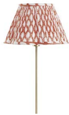
Lampshade Flower Cypress Orange 100% Cotton on metal frame CA3377 – 27cm/14cm H16cm