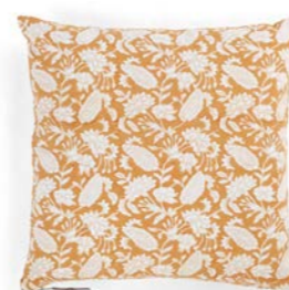
Cushion Cover Jodhpur Orange 100% Cotton