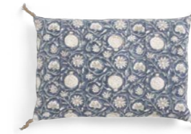
Cushion Cover w. tassels Tangier Pomegranate Blue 100% Cotton