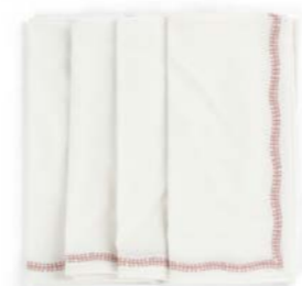
Napkins (set of 4) Embroidery Lantana Rose 100% Cotton