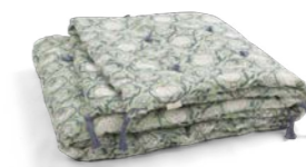
Quilt w. tassels Tangier Pomegranate Green 100% Cotton w. polyester filling