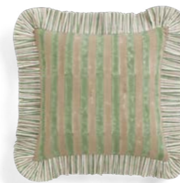
Cushion Cover w. ruffle Jaipur Stripe Green 100% Cotton