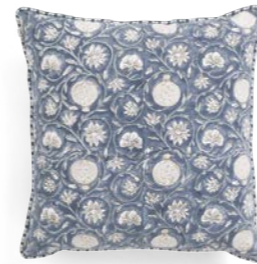
Cushion Cover Tangier Pomegranate Blue 100% Cotton