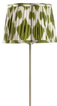
Lampshade Scallop Ikat Green 100% Silk on metal frame CA3381 – 30cm/25cm H20cm