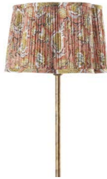
Lampshade Scallop Pomegranate Orange 100% Cotton on metal frame CA3379 – 35cm/30cm H23cm CA3380 – 40cm/36cm H25cm