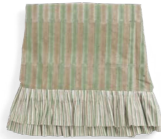
Tablecloth Jaipur Stripe Green & Beige 100% Cotton

CA3530 – 150 x 230 cm CA3531 – 170 x 270 cm CA3532 – 150 x 350 cm CA3533 – 170 x 400 cm CA3534 – 220 cm diameter CA3535 – 160 cm diameter