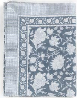
Tablecloth Indian Rose True Navy 100% Cotton

CA3553 – 150 x 230 cm CA3554 – 170 x 270 cm CA3555 – 150 x 350 cm CA3556 – 220 cm diameter CA3557 – 160 cm diameter