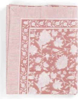
Tablecloth Indian Rose Lantana Rose 100% Cotton

CA3548 – 150 x 230 cm CA3549 – 170 x 270 cm CA3550 – 150 x 350 cm CA3551 – 220 cm diameter CA3552 – 160 cm diameter