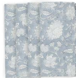
Napkins (set of 4) Indian Rose Dusty Blue 100% Cotton