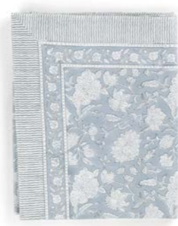
Tablecloth Indian Rose Dusty Blue 100% Cotton

CA3558 – 150 x 230 cm CA3559 – 170 x 270 cm CA3560 – 150 x 350 cm CA3561 – 220 cm diameter CA3562 – 160 cm diameter