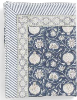
Tablecloth Tangier Pomegranate Blue 100% Cotton

CA3519 – 150 x 230 cm CA3520 – 170 x 270 cm CA3521 – 150 x 350 cm CA3522 – 170 x 400 cm CA3523 – 220 cm diameter CA3524 – 160 cm diameter