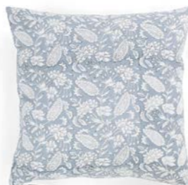
Cushion Cover Jodhpur Dusty Blue 100% Cotton