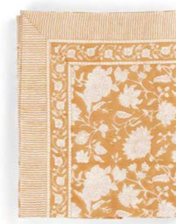
Tablecloth Indian Rose Orange 100% Cotton

CA3568 – 150 x 230 cm CA3569 – 170 x 270 cm CA3570 – 150 x 350 cm CA3571 – 220 cm diameter CA3572 – 160 cm diameter