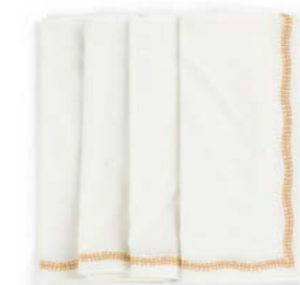
Napkins (set of 4) Embroidery Orange 100% Cotton