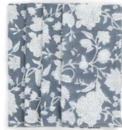
Napkins (set of 4) Indian Rose True Navy 100% Cotton

CA3563 – 150 x 230 cm CA3564 – 170 x 270 cm CA3565 – 150 x 350 cm CA3566 – 220 cm diameter CA3567 – 160 cm diameter