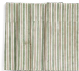
Napkins (set of 4) Stripe Multi Green 100% Cotton