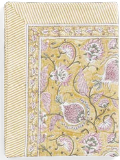
Tablecloth Pomegranate Yellow & Rose 100% Linen

CA3629 – 150 x 230 cm CA3630 – 170 x 270 cm CA3631 – 150 x 350 cm CA3632 – 220 cm diameter