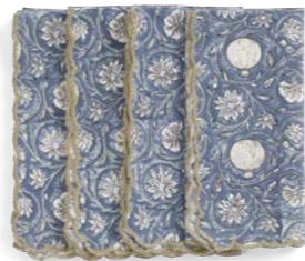
Napkins Scallop (set of 4) Pomegranate Blue 100% Cotton