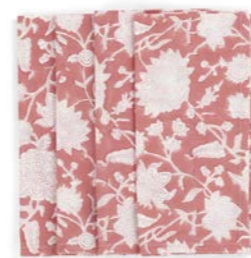
Napkins (set of 4) Indian Rose Lantana Rose 100% Cotton