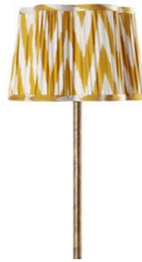
Lampshade Scallop Ikat Yellow 100% Silk on metal frame CA3386 – 25cm/20cm H17cm