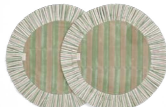
Round Placemats w. ruffle (set of 2) Jaipur Stripe Green Cotton