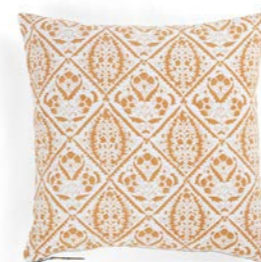
Cushion Cover Jaipur Orange 100% Cotton