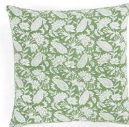
Cushion Cover Jodhpur Green Tea 100% Cotton