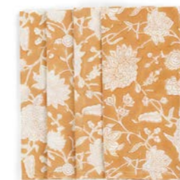
Napkins (set of 4) Indian Rose Orange 100% Cotton