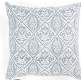
Cushion Cover Jaipur Dusty Blue 100% Cotton