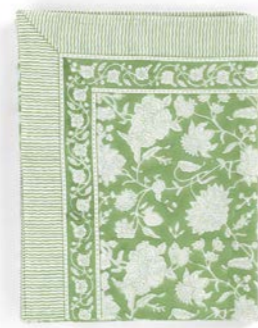
Tablecloth Indian Rose Green Tea 100% Cotton

CA3553 – 150 x 230 cm CA3554 – 170 x 270 cm CA3555 – 150 x 350 cm CA3556 – 220 cm diameter CA3557 – 160 cm diameter