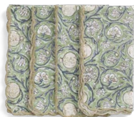
Napkins Scallop (set of 4) Pomegranate Green 100% Cotton