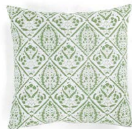
Cushion Cover Jaipur Green Tea 100% Cotton