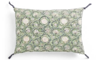
Cushion Cover w. tassels Tangier Pomegranate Green 100% Cotton