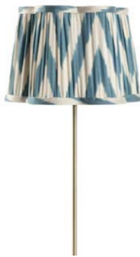
Lampshade Scallop Ikat Blue 100% Silk on metal frame CA3383 – 30cm/25cm H20cm