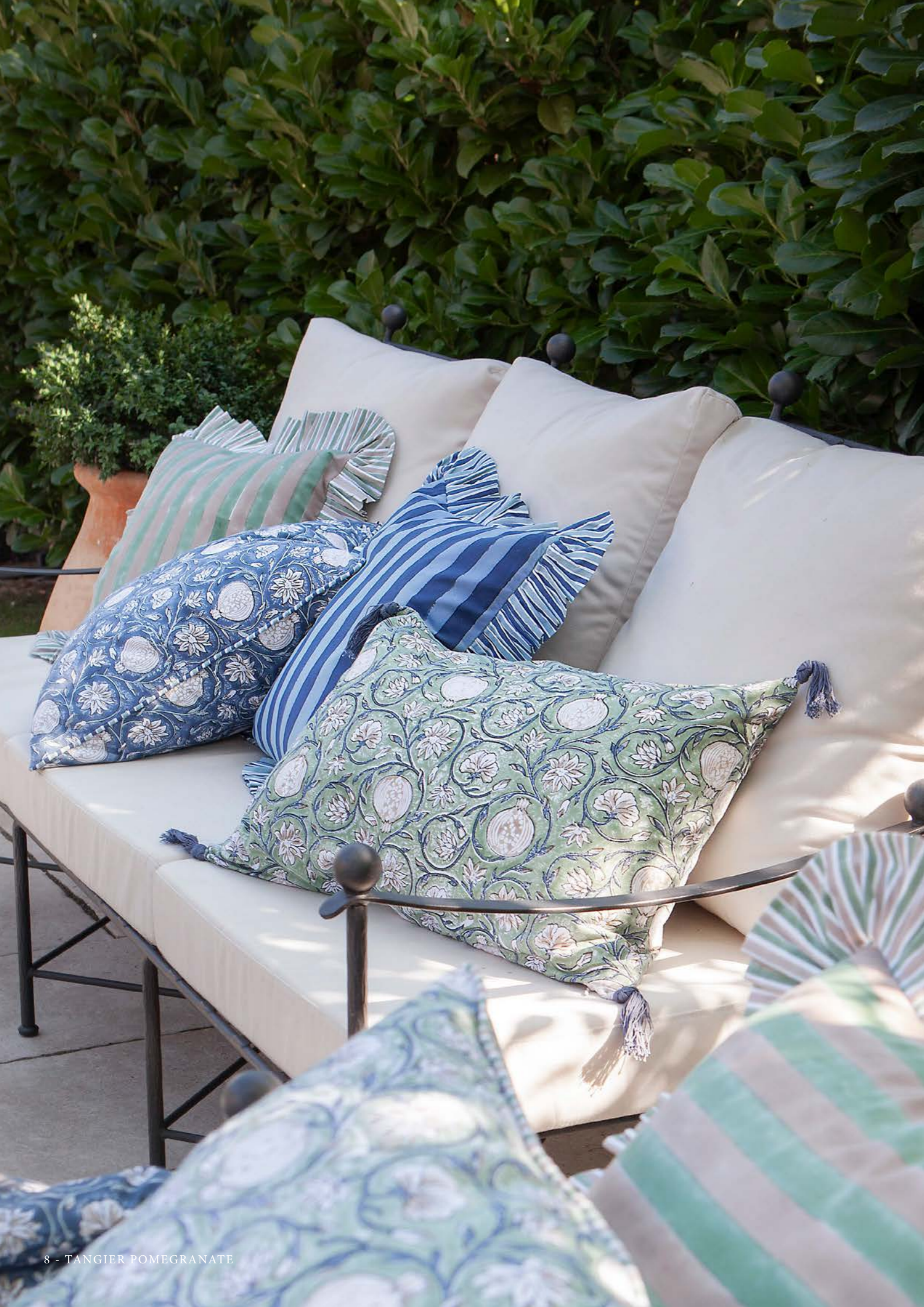
8 - TANGIER POMEGRANATE