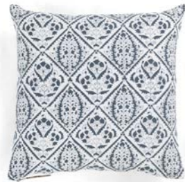
Cushion Cover Jaipur True Navy 100% Cotton