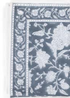
Kitchen Towels (set of 2) Indian Rose True Navy 100% Cotton