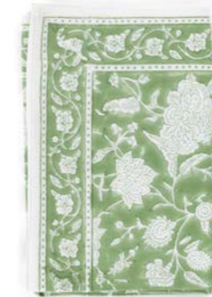
Kitchen Towels (set of 2) Indian Rose Green Tea 100% Cotton