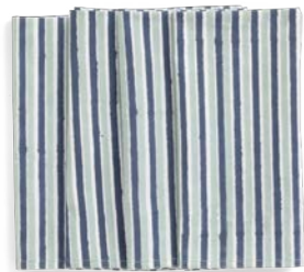
Napkins (set of 4) Stripe Multi Blue 100% Cotton