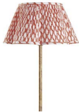
Lampshade Flower Cypress Orange 100% Cotton on metal frame CA3378 – 41cm/23cm H21cm