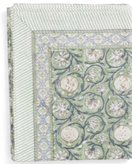
Tablecloth Tangier Pomegranate Green 100% Cotton

CA3519 – 150 x 230 cm CA3520 – 170 x 270 cm CA3521 – 150 x 350 cm CA3522 – 170 x 400 cm CA3523 – 220 cm diameter CA3524 – 160 cm diameter