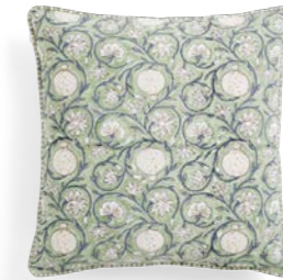
Cushion Cover Tangier Pomegranate Green 100% Cotton