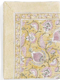
Tablecloth Pomegranate Yellow & Rose 100% Cotton

CA3629 – 150 x 230 cm CA3630 – 170 x 270 cm CA3631 – 150 x 350 cm CA3632 – 220 cm diameter