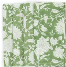
Napkins (set of 4) Indian Rose Green Tea 100% Cotton