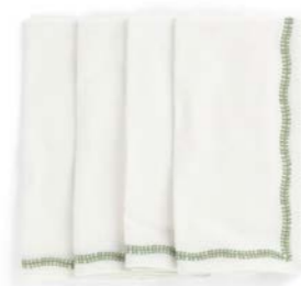
Napkins (set of 4) Embroidery Green Tea 100% Cotton