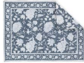
Placemats (set of 2) Indian Rose True Navy 100% Cotton