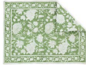
Placemats (set of 2) Indian Rose Green Tea 100% Cotton