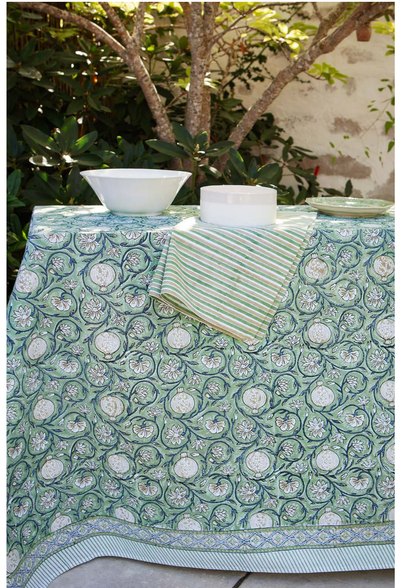
TANGIER POMEGRANATE - 9