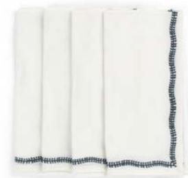
Napkins (set of 4) Embroidery True Navy 100% Cotton