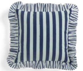
Cushion Cover w. ruffle Jaipur Stripe Blue 100% Cotton