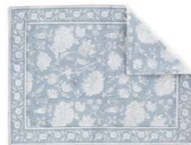
Placemats (set of 2) Indian Rose Dusty Blue 100% Cotton