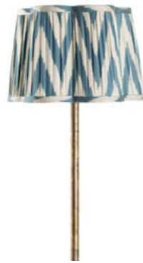
Lampshade Scallop Ikat Blue 100% Silk on metal frame CA3384 – 25cm/20cm H17cm