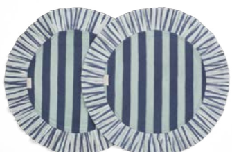
Round Placemats w. ruffle (set of 2) Jaipur Stripe Blue Cotton